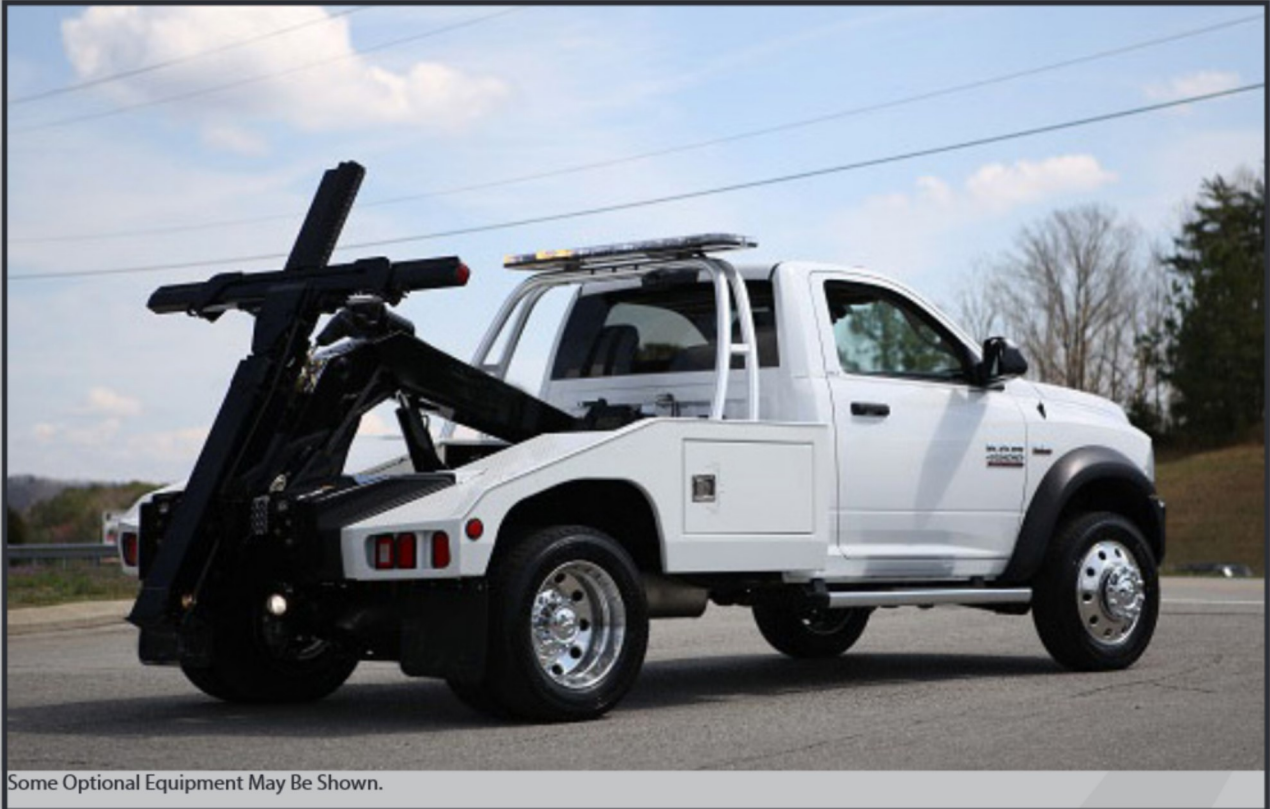
Some Optional Equipment May Be Shown.

In 1916, Ernest Holmes pioneered a new industry with his first twin-boom wrecker. Holmes has continued that pioneering tradition for 100 years with quality and innovation that towers have come to rely on. One of the most popular light-duty units ever built was the Holmes 440, which became a 25-year industry standard for economy and dependability. That reputation lives on with the new Holmes 440-G2, a no-nonsense auto loader designed to tackle your towing needs. An 8,000-pound recovery boom, 8,000-pound winch and an auto load system rated at 4,000 pounds with in-cab controls for quick and easy operation make the 440-G2 ideal for light-duty towing. The carbon-steel modular body features two spacious tool compartments for equipment storage. For a quick, reliable and economical answer to your towing needs, check out the Holmes 440-G2.